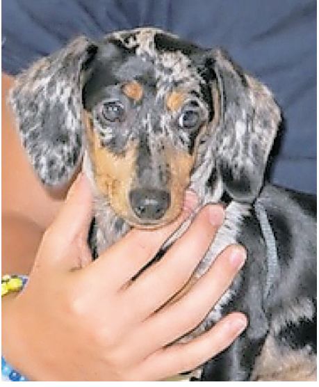
Be the envy of the dog park and send your dog to the head of class at obedience class.

Applications and information packets for Leader in Training volunteer positions for Summer 2020 will be available at the Recreation Office on Monday, January 27th. Eligible LIT's must be entering 9th or 10th grade in September 2020.