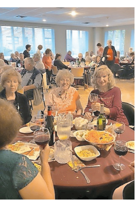
There are no strangers at the Sandel Center. Just friends you haven't met yet!