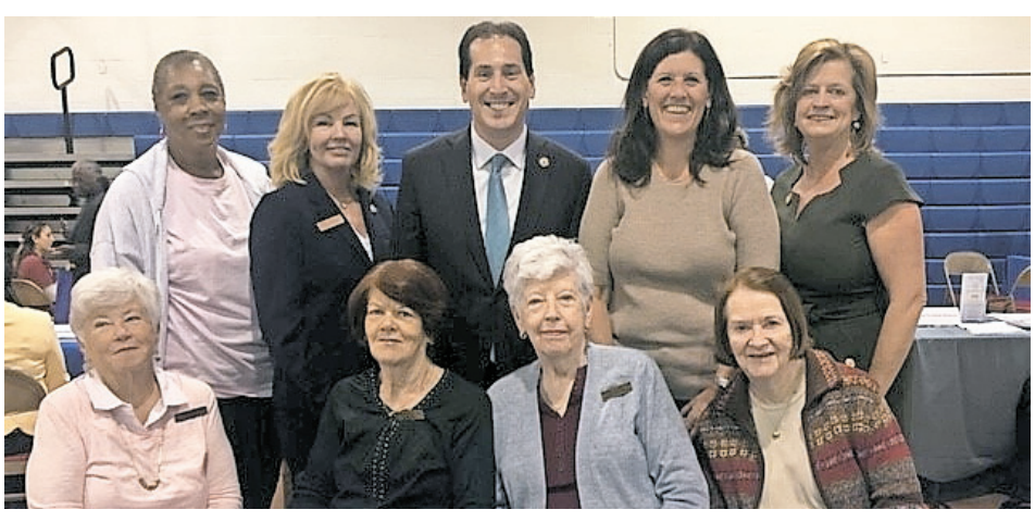
The \ Sandel \ Executive \ Committee \ represented \ the \ Senior \ Center \ at \ the \ 2019 \ Golden \ Gathering \ on \ October \ 25th.