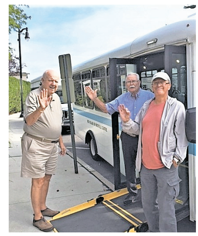
The Senior Men's club offers trips, guest speakers, special events and more.