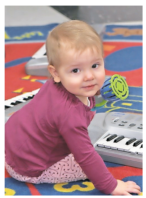
Find the beat with your toddler and the popular Happy Piano class.

Nursery School Registration for the 2020-2021 school year begins on January 20th for residents and is on-going until classes are filled. Call the Recreation Center office with any questions or to arrange a visit. Children entering Kindergarten in 2021 and 2022 are eligible to participate. We offer morning and afternoon sessions. Children who will be two years-of-age on or before September 30, 2020 may register for the morning Time For Two's class. Registration for all Nursery School programs must be submitted in person, with proof of age via birth certificate required.