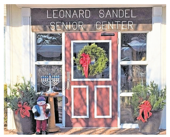
The Sandel Center is a wonderful place to be during the holiday season.

winter for all to enjoy. For more information call (516) 678-9245 or visit our website: www.rvcny.gov/senior-citizens